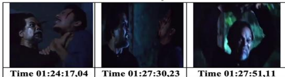
Figure 3. The battle between Adam and Pak Osman

Despite Pak Osman resorting to the devil's power to eliminate Adam, Adam's unwavering faith in the supremacy of Allah SWT remained steadfast. This conviction stems from the belief that only Allah SWT's power surpasses that of all creatures. The final confrontation between them concludes with Pak Osman meeting a grim fate, struck by lightning. Abu Bakr al-Jassas emphasized that Allah SWT possesses ultimate power, uncontested by any being (Abu Su'ud, n.d.). His authority is absolute, as stated in the Quran: "Say, [O Muhammad], 'O Allah, Owner of Sovereignty, You give sovereignty to whom You will and You take sovereignty away from whom You will'" (Surah Ali 'Imran, 3:36). This sequence is depicted in Figure 3 (timestamp 01:24:17-01:27:51).